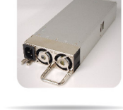
Optional N+1 redundant PSU