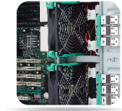
Hot-swap fan (SR108)