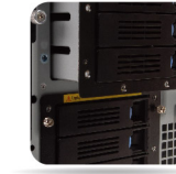
Removable HDD cage for hot-swap or non hot-swap