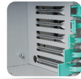
Screwless card retainer