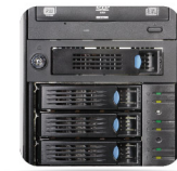
3 x 5.25" bays for ODD or storage kits