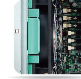
Easy-swap 120mm rear fan