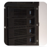
Removable HDD cage for hot-swap or non hot-swap