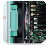
1 x rear 120 mm PWM fan