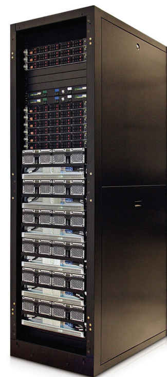
HGST Active Archive System

Until now, the freedom to archive without limits was constrained by the limits of available capacity and IT budgets. Cloud customers have had to trade off better decision making with what data to keep and what to throw away. HGST has removed a major barrier to innovation with its limitless cloud storage platform, the Active Archive System. This ready out-of-the-box, S3-compliant object storage system allows cloud storage providers to easily deploy and scale their cloud foundation so they can focus on providing valuable services and applications on top. This turn-key object storage system can be up and running in minutes and the system has limitless scale across data centers and geographies. Its breakthrough TCO beats the white box economics of DIY cloud infrastructure, has the highest density per square foot and the lowest cost per terabyte, allowing cloud storage providers to offer a competitive alternative to the public cloud.